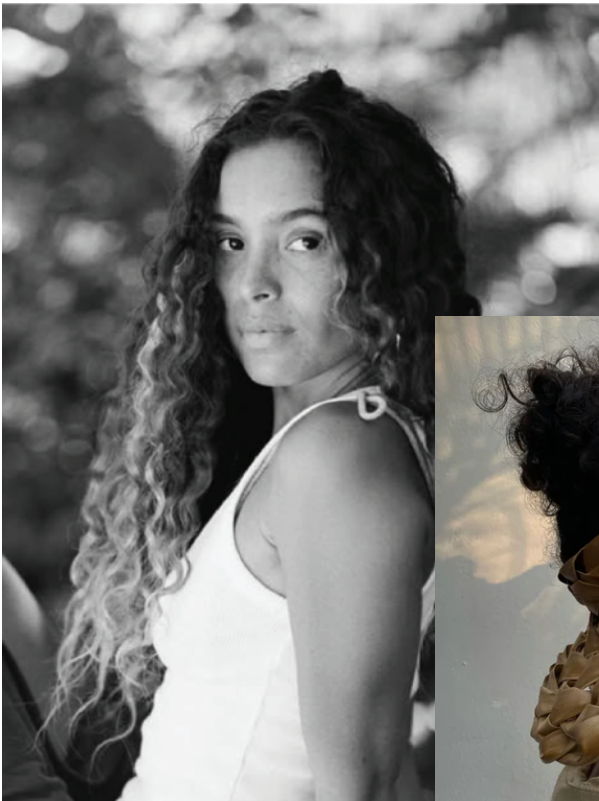
Eye contact like this