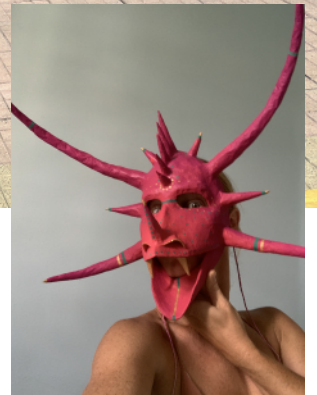
Design exploration- would prefer 2 women...